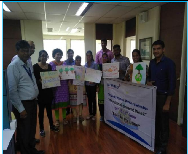
Drawings by the participants