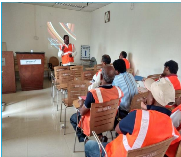
Participants during competition