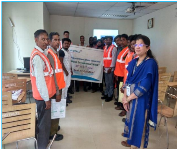
Awareness campaign for contracted staff