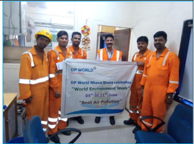
Awareness campaign for employees & contracted staff