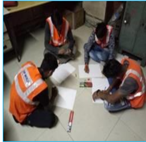
Drawings by the participants