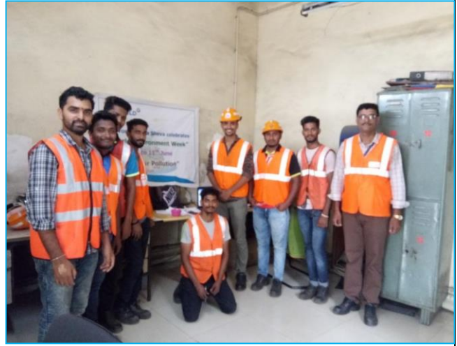
Awareness campaign with reefer staff