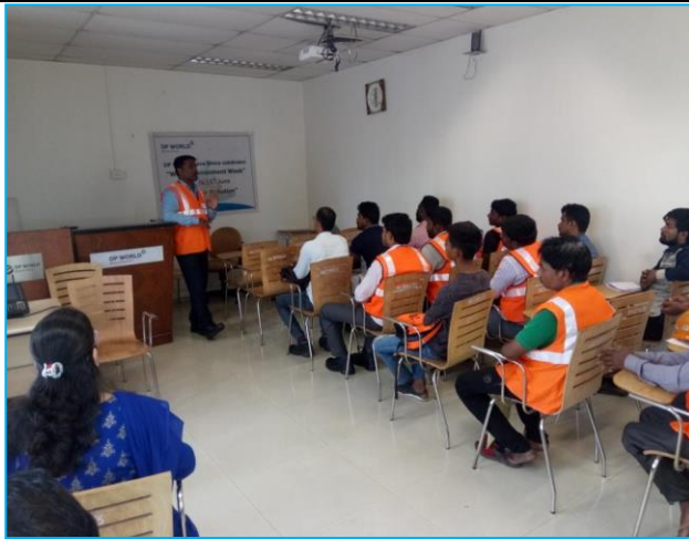
Awareness campaign for contracted staff