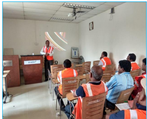
Participants during competition