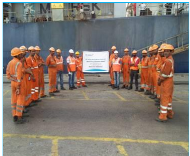
Awareness campaign for employees / contracted staff