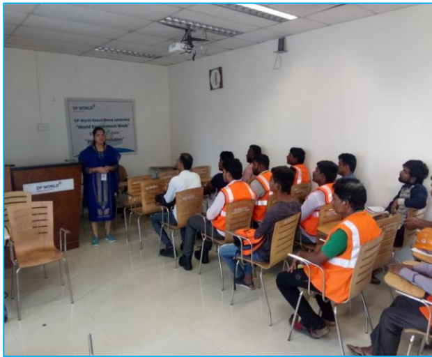
Awareness campaign with contracted staff