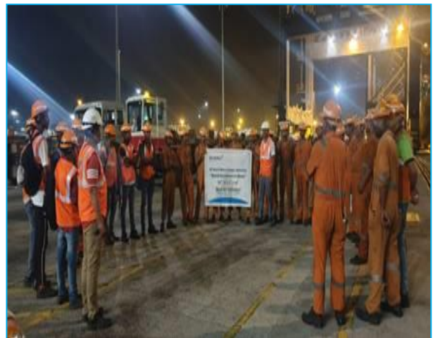
Awareness campaign for employees & contracted staff