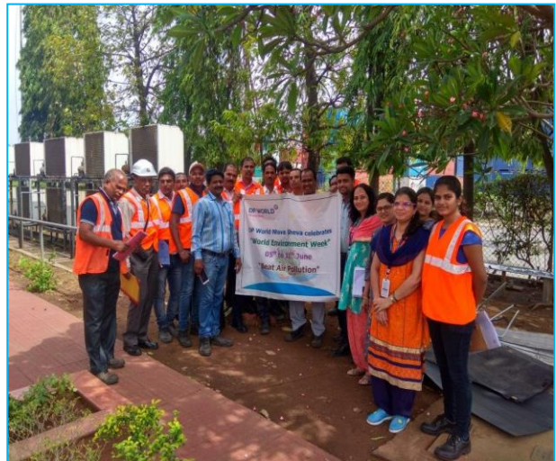
Awareness campaign with contracted supervisor