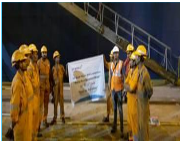
Awareness campaign for lashers / Checkers