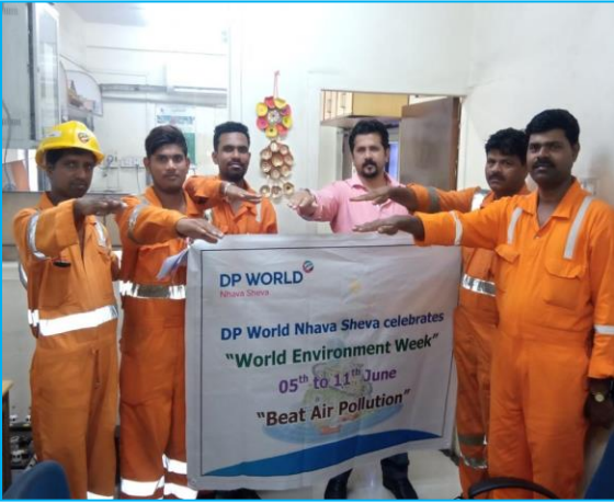
Environment pledge with employees & contracted staff

The awareness sessions with management employees and contracted staff was conducted through Environmental messages, banner display, tool box talks and notice board displays etc.