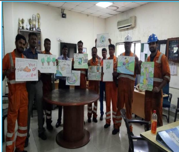
Drawings by the participants