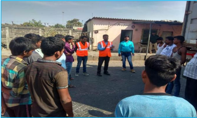
Mock drill - Gas Leak