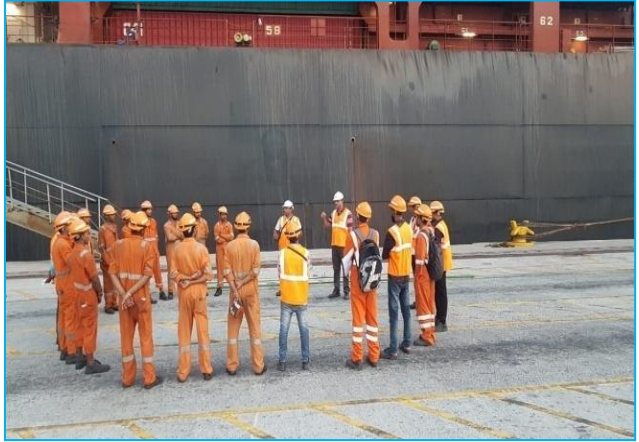
Awareness sessions with External truck drivers at Parking plaza