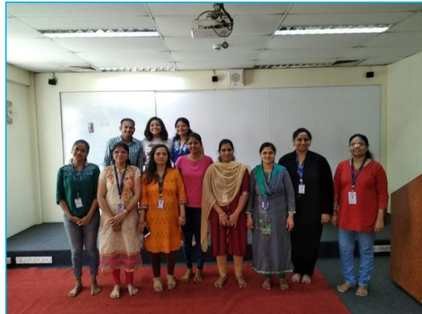
Yoga session for employees

On account of world hypertension day, Special awareness session was conducted for employees & contractors. Yoga session was arranged in coordination with HR team for employees. Exercises and stretching workouts for relieving and coping stress was demonstrated by the instructor. Session ended with brief addressing by instructor regarding stress management and balanced life. Also Blood pressure check up for employees & contracted staff was arranged through paramedic.