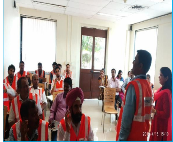
Fire safety awareness contractors / employees