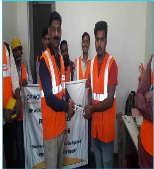
Participants receiving gifts