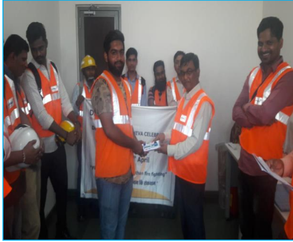
Spot Quiz Competition