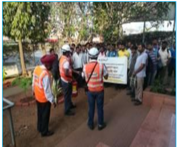
Fire Demo for contracted staff