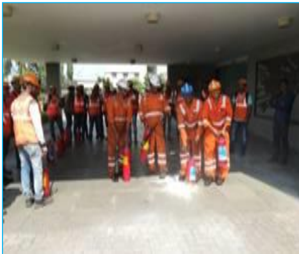
Fire Demo for Employees

Fire extinguishers play an important role in controlling fire at its initial stage so proper knowledge to use the fire extinguisher is necessary. On the occasion of fire safety week, a demo for use of fire extinguisher was given to employees and contractors.