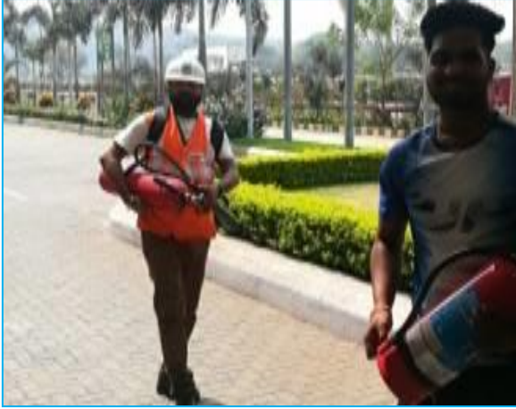
Winners of this competition