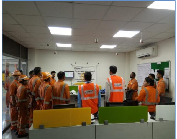
Fire awareness with engineering team