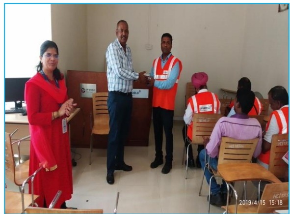
Spot Quiz Competition