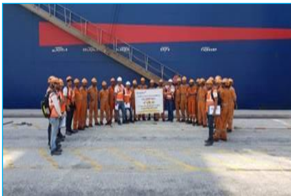
Fire Safety Awareness with Lashers / Checkers

On the occasion of this fire safety week, emphasis was given on awareness for ITV drivers, lashers, checkers , reefer tech, ITD Staff equipment operators & management staff.