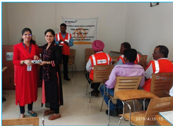
Spot Quiz Competition