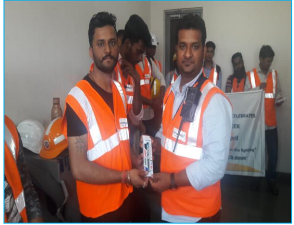
Spot Quiz Competition