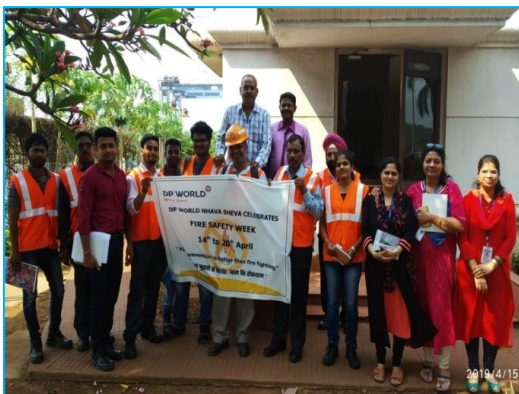
Fire awareness with Contract supervisors