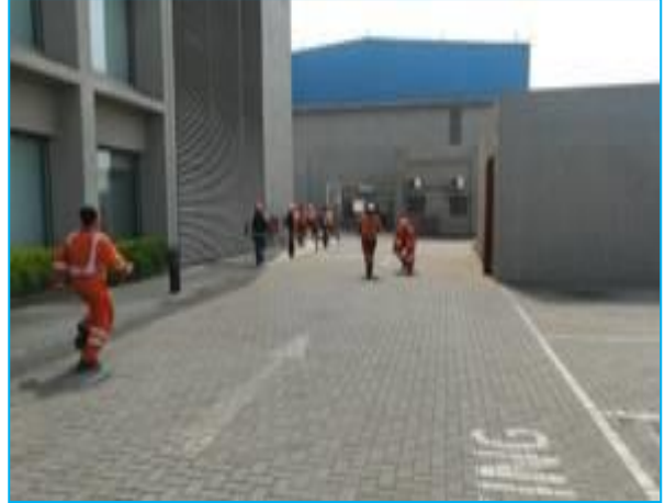
Employees & contractors participating in competition