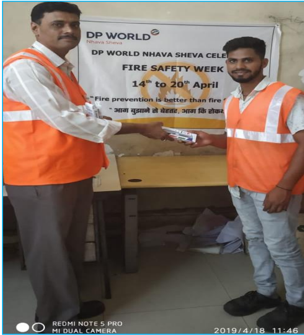
Winners of the quiz competition

As part of ongoing Fire safety week celebration, spot quiz competition was conducted with employees, contractor supervisors. Prizes were distributed among the winners and congratulated everyone for their active involvement in the programs.