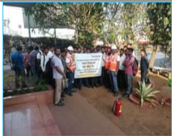
Fire awareness with employees