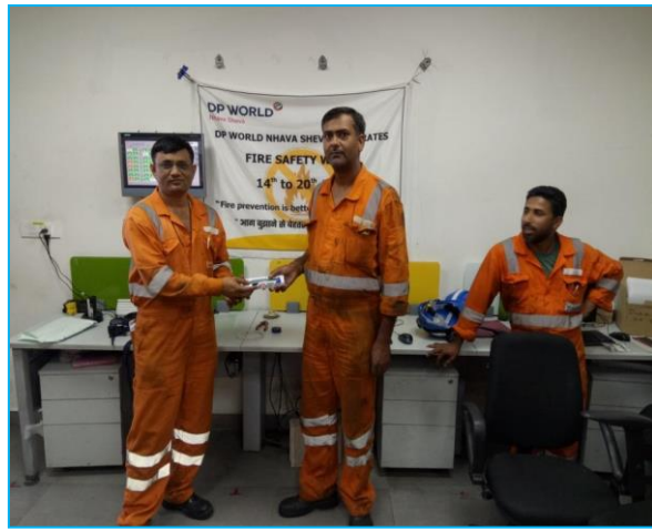
Engg team during quiz competition