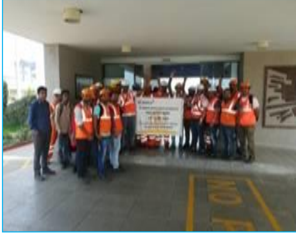
Fire Safety Awareness with employees