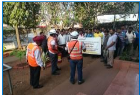
Fire Safety Awareness with ITV Drivers