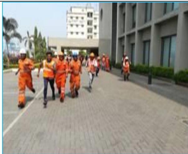
Employees & contractors participating in competition