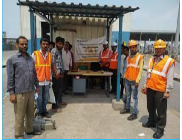
Fire Safety awareness with ITV Drivers