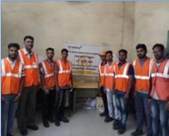
Fire awareness with Checkers / Lashers