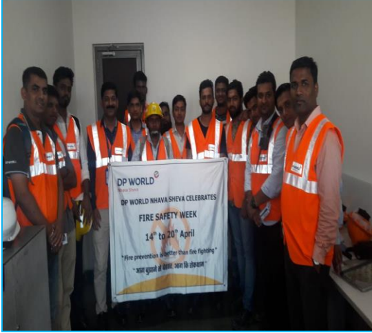
Fire safety awareness with ITD / Reffer Staff