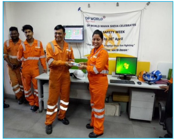
Engg team during quiz competition