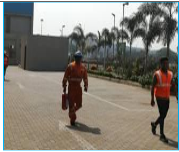
Employees & contractors participating in competition