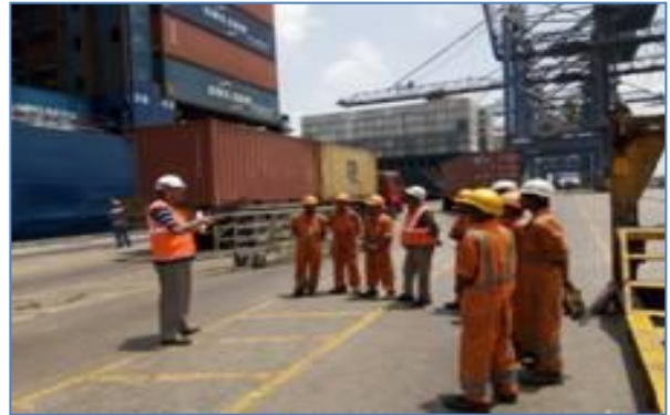
Tool Box talk with Lashers/ Deck/Wharf checkers