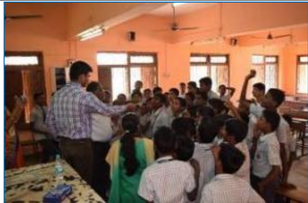
HSE representative distributing gifts for winners